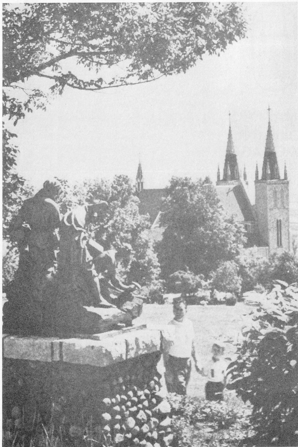
Martyrs' Shrine in Midland, Ont., countryside